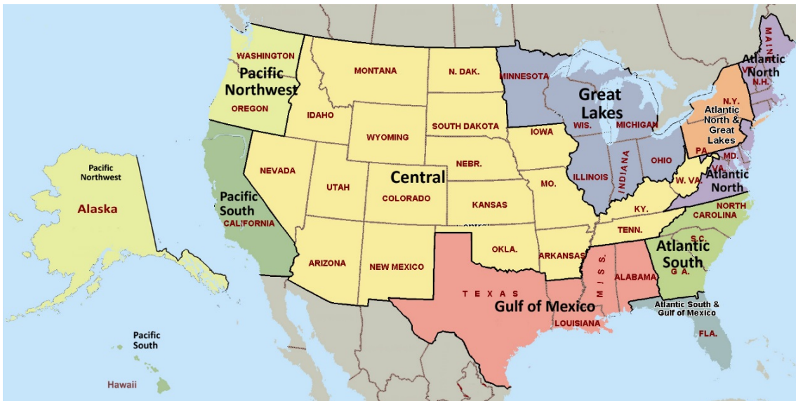
Figure 2. U.S. regions for economic analysis of the marina industry.

IMPLAN models were developed for seven separate regions of the United States, as shown in Figure 2. The regions were defined to represent different climatic coastal areas, plus a central region for non-coastal states. The state of Florida was divided into the South Atlantic and Gulf of Mexico regions, and the states of New York and Pennsylvania were divided between the North Atlantic and Great Lakes regions. Alaska was included in the Pacific Northwest region, and Hawaii was included in the Pacific-South region.